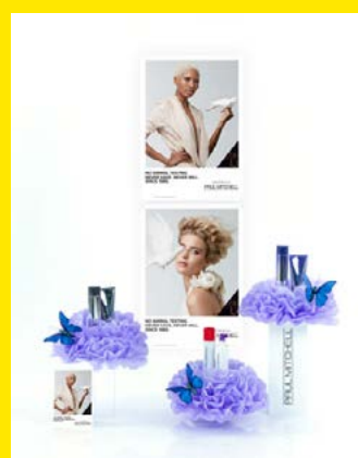
POM POM KIT