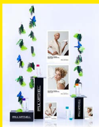
PALM LEAF GARLAND KIT